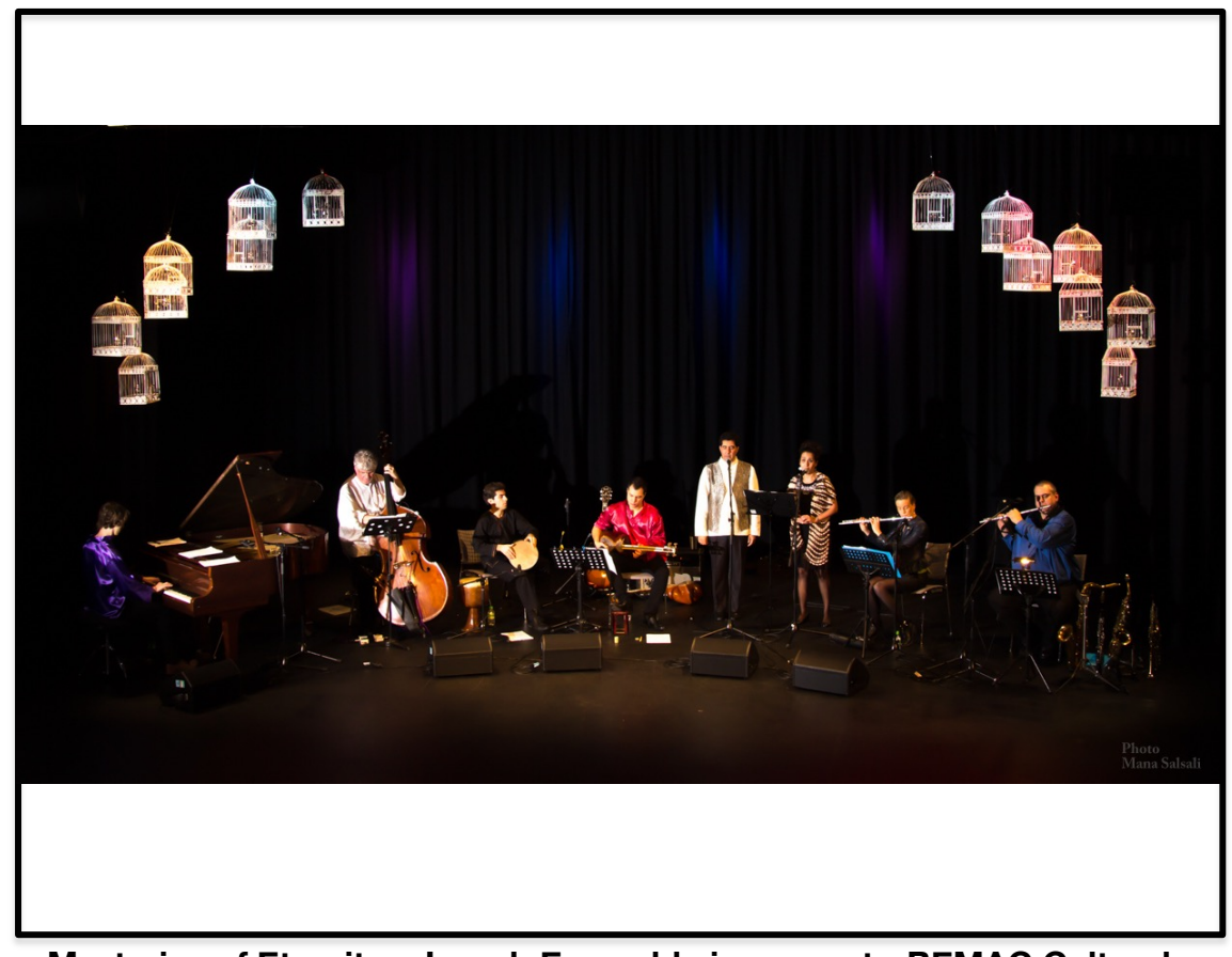
Mysteries of Eternity - Jazzab Ensemble in concert - BEMAC Cultural Diversity Week 2014